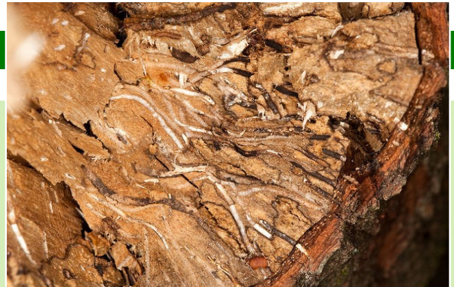
A cross section of a swampbay tree trunk shows the redbay ambrosia beetle's galleries (white lines) filled with the fungus Raffaelea lauricola , the cause of laurel wilt disease.

Consult local extension sources or crop consultants for specific recommendations regarding trap placement, monitoring and subsequent management options.