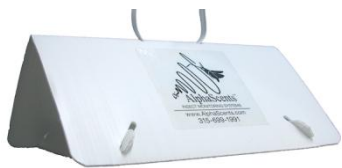
White Plastic Delta Trap , large, multi-season, comes with 1 No-mess Sticky Card™ insert, with hanger