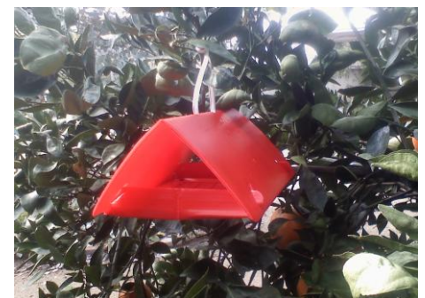
Plastic Delta Trap