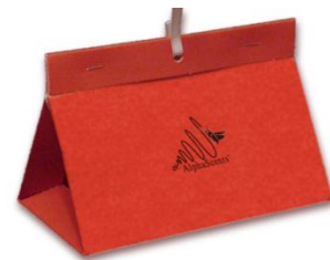
Paper Delta Trap , red, single use, with hanger