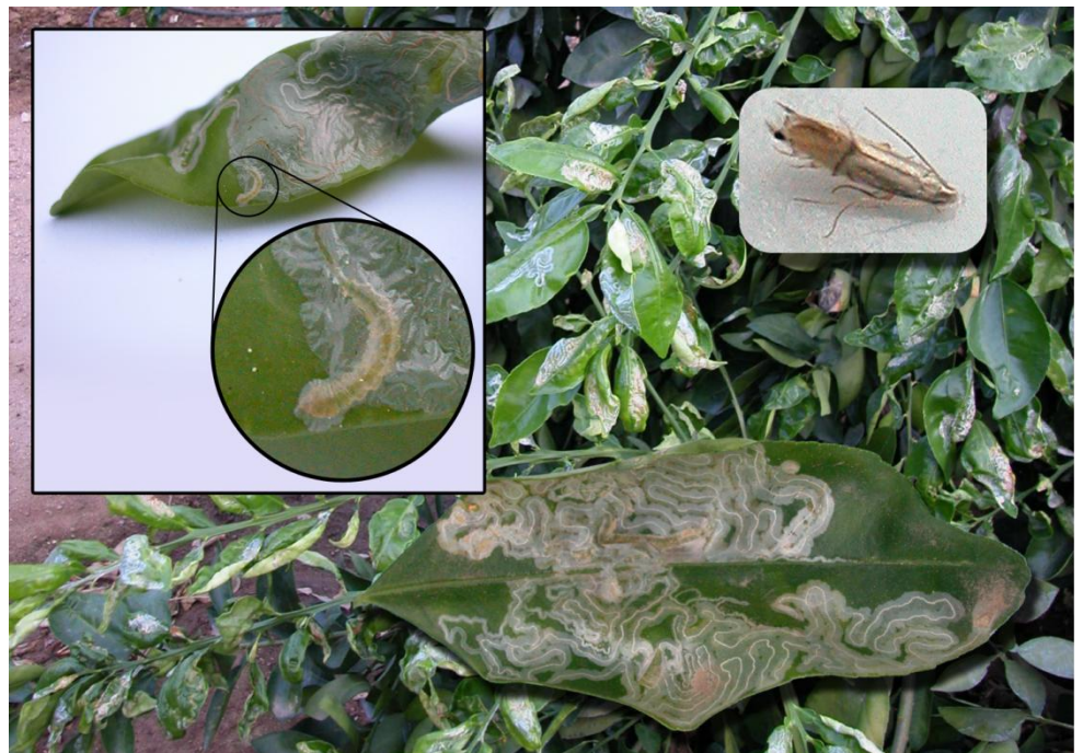
Fig 1: larvae mining, mature male moth, leaf damage, heavily infested lemon tree