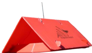
Red Plastic Delta Trap , large, multi-season, comes with 1 No-mess Sticky Card™ insert, with hanger