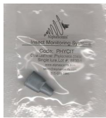
PHYCIT Lure for CLM , Phyllocnistis citrella