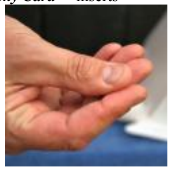
Messy for the pest but not for you!