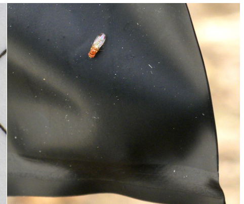
SWD continue to land on lure throughout life of lure.