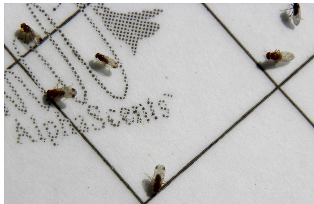
Similar results using white color plastic delta trap liner or wing trap bottom.

SWD are attracted by the lure and stick to the trap as shown. Center photo is capture after only 2 hours. Right photo is capture after 24 hours in rain.