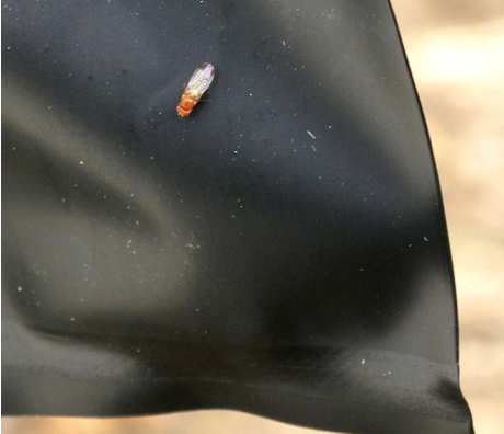
SWD continue to land on lure throughout life of lure.