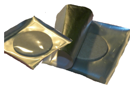
Fig 2. Lure Part 2.