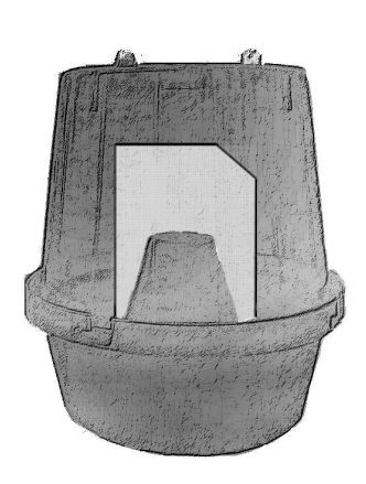
Fig 3. Lure placement in McPhail trap